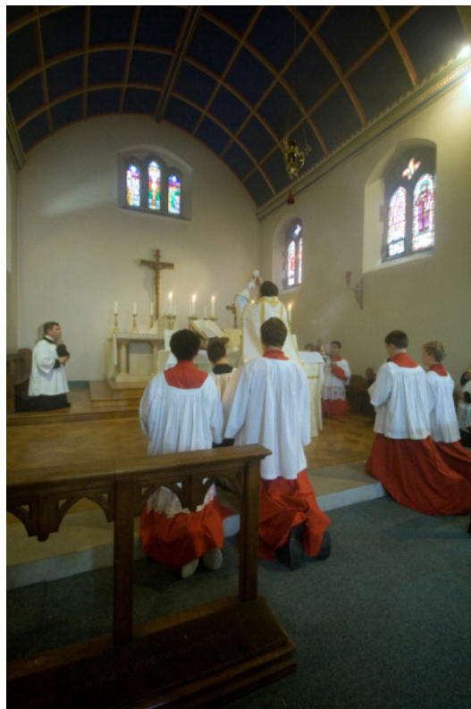
Pictures: top, the Summer School sewing group; bottom, Mass in Lewes during the Summer School.

Among Latin courses it is uniquely affordable, thanks to our generous benefactors, and there is a 50% discount for students in full-time education. See the application form.