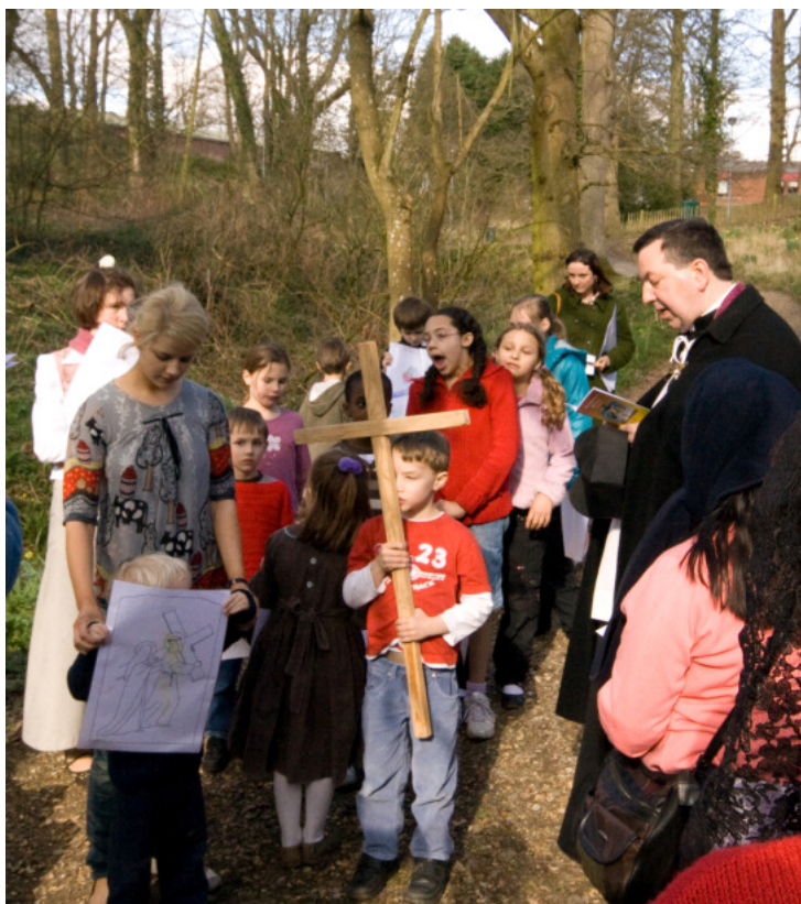
Pictures: top class at the School; bottom children at the Family Retreat Bottom right Oratory School

As in 2009, a chant course will run alongside the Family Retreat. These will take place in a new venue: The Oratory School.